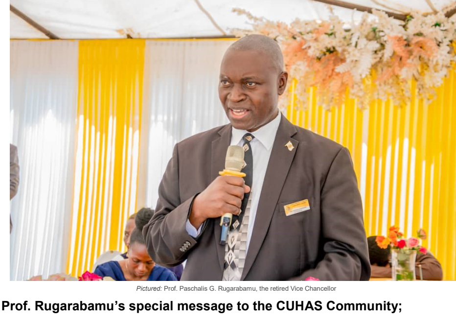
"Between July 2014 and June 2024, I was blessed to lead Teams of Skilled, Committed, and Capable Staff within Schools, the Institute, Directorates and

different departments of Administration that together form The Catholic University of Health and Allied Sciences (CUHAS).